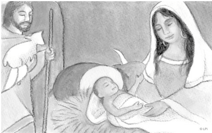
The shepherds went in haste to Bethlehem and found Mary and Joseph, and the infant lying in the manger. When they saw this, they made known the message that had been told them about this child. - Luke 2:16-17